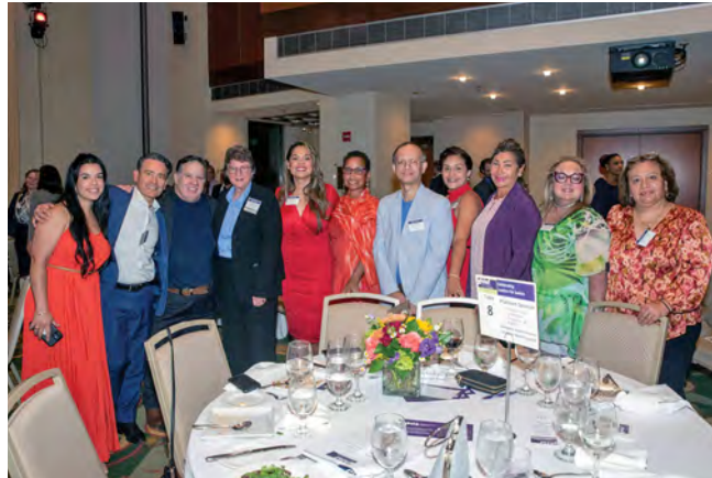
Hispanic Health Council leadership and staff