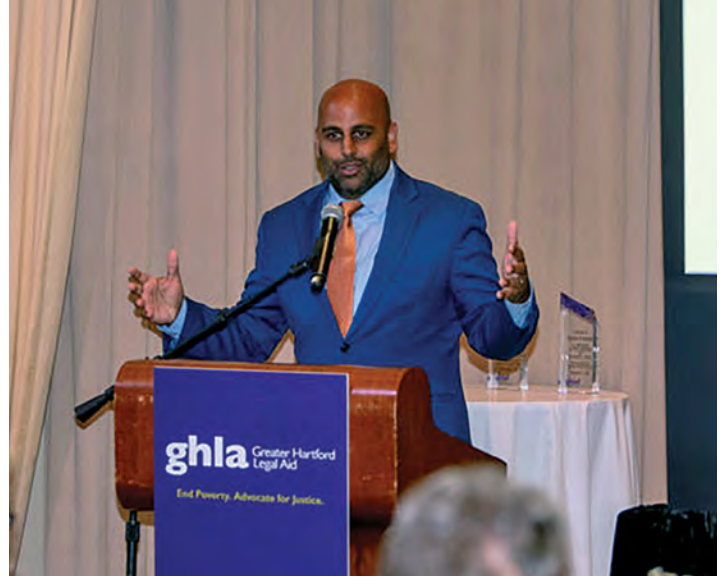
Mayor Arunan Arulampalam , City of Hartford