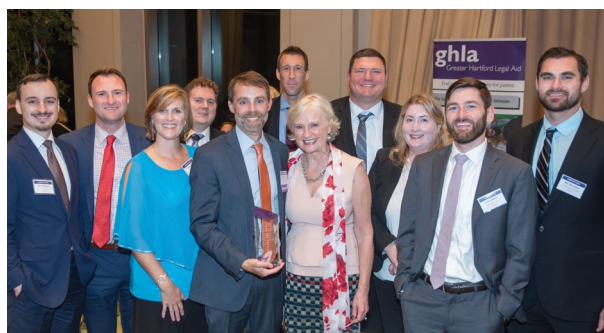
Rogin Nassau Attorneys at Law Rogin Nassau LLC